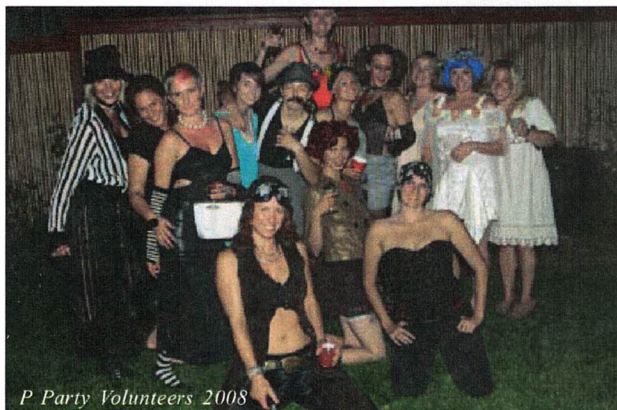
P Party Volunteers 2008

In 1994, several community organizations in the City of Boulder collaborated on a series of events to celebrate Gay Pride. This collective was called Boulder Pride. As the LGBTQ community grew, the need for Boulder Pride to broaden its purpose grew as well. In 1999, Pride became a state tax-exempt organization. In 2001, Pride received a three year grant from the Gill Foundation to secure a community center and start offering services to the LGBT community. The Community Center opened officially in 2004 and Pride began offering direct services to LGBT youth in Boulder County. Through the consistent and dedicated efforts of Boulder Pride's board, staff, and community, Boulder Pride has steadily grown every year, thus, being able to provide a more diverse array of services and programs to its constituents.