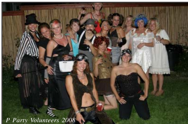
P Party Volunteers 2008

In 1994, several community organizations in the City of Boulder collaborated on a series of events to celebrate Gay Pride. This collective was called Boulder Pride. As the LGBTQ community grew, the need for Boulder Pride to broaden its purpose grew as well. In 1999, Pride became a state tax-exempt organization. In 2001, Pride received a three year grant from the Gill Foundation to secure a community center and start offering services to the LGBT community. The Community Center opened officially in 2004 and Pride began offering direct services to LGBT youth in Boulder County. Through the consistent and dedicated efforts of Boulder Pride's board, staff, and community, Boulder Pride has steadily grown every year, thus, being able to provide a more diverse array of services and programs to its constituents.